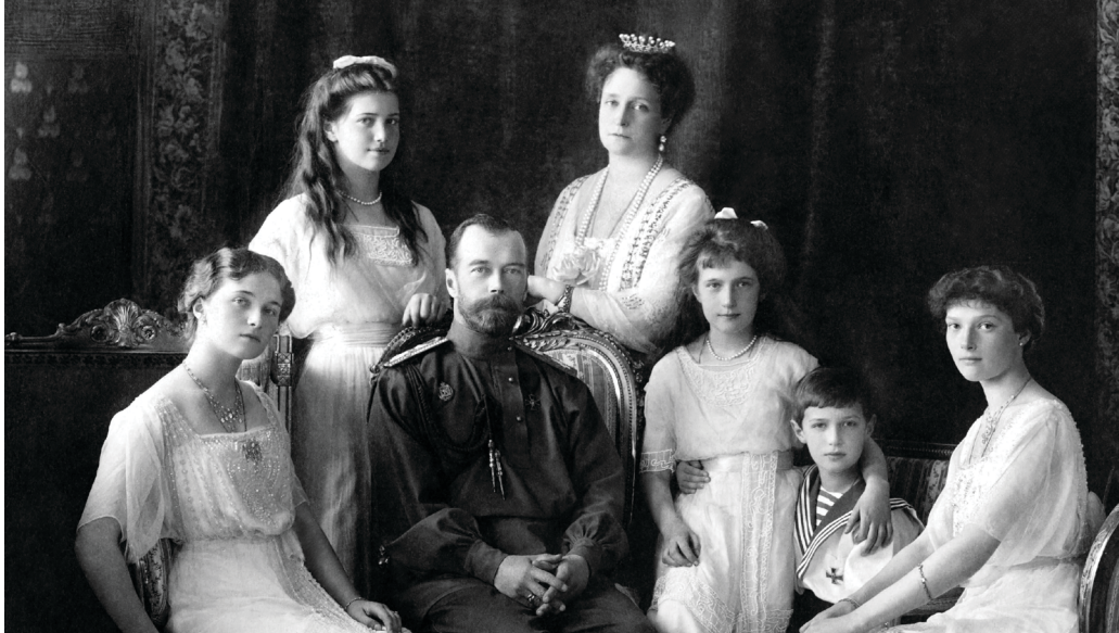
The Russian Imperial Family - Seated (left to right): Olga, Tsar Nicolas, Anastasia, Alexei, Tatiana Standing (left to right): Maria, Tsarina Alexandra